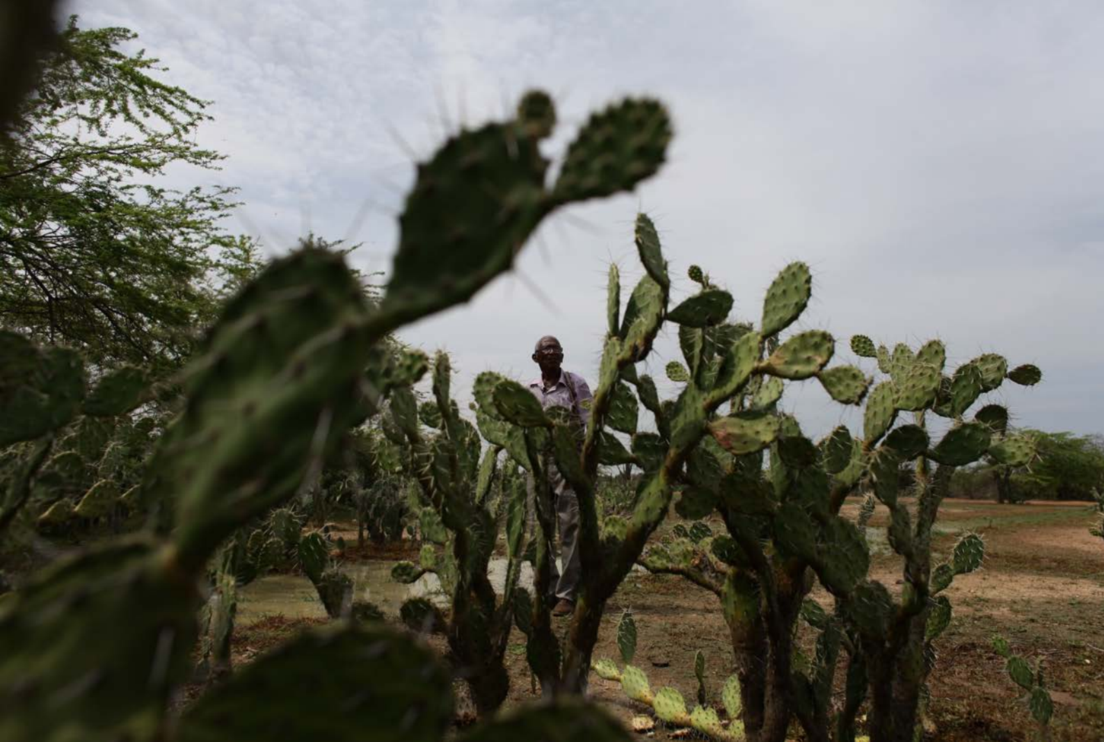
Arid tropical zone of Valledupar, Colombia.