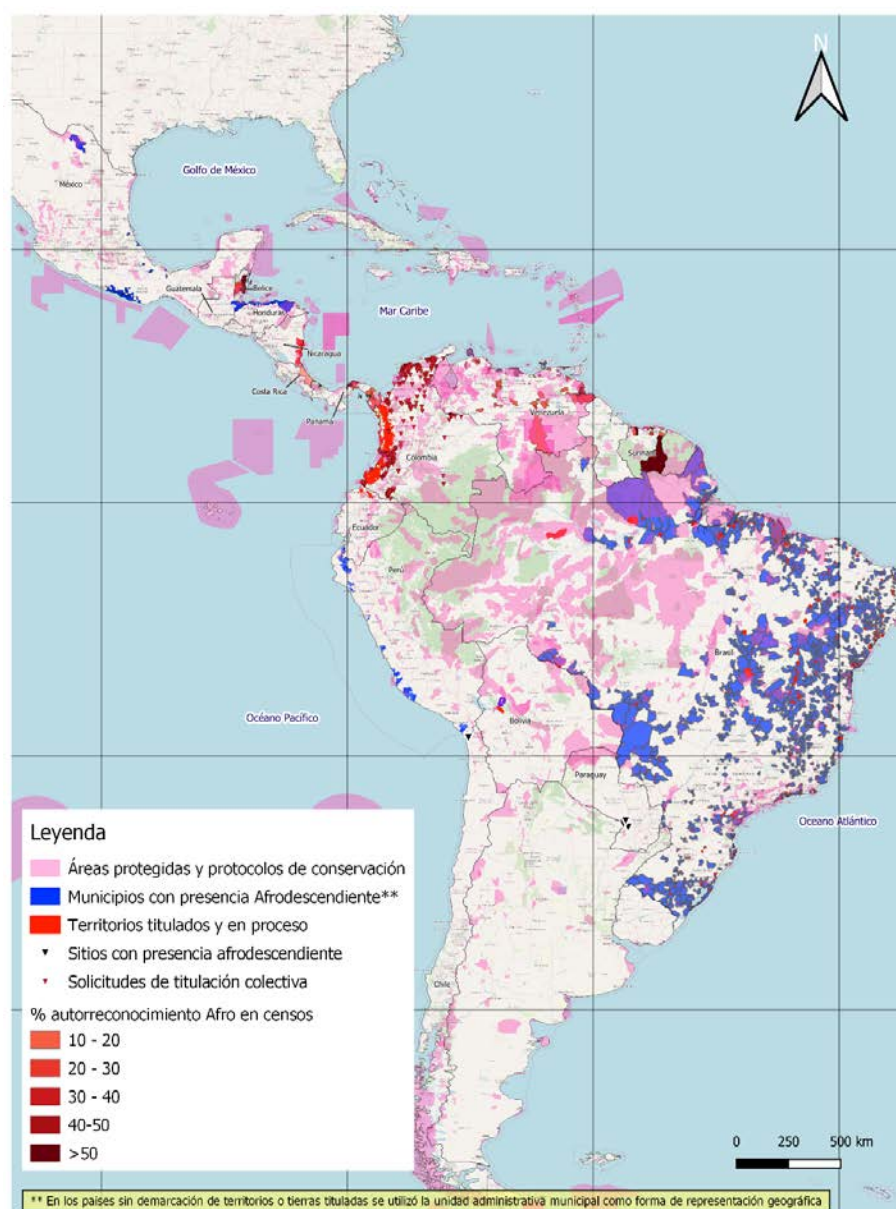
Map 3. Protected areas and Afro-descendant Peoples' territories

Based on the public policies, strategies, and action plans for biodiversity conservation in each of the countries studied, it is possible to identify gaps in the effective involvement of Afro-descendant Peoples in the implementation of these measures. This study suggests four categories considering the countries analyzed with the available information.