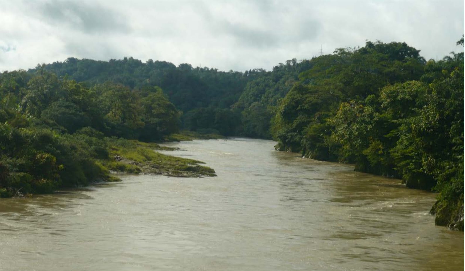
Landscape of Cauca, a Department of Southwestern Colombia.