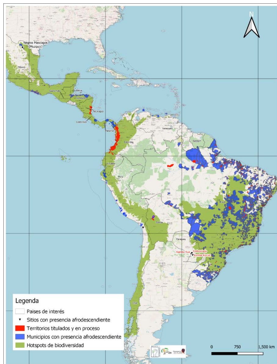
Map 1. Afro-descendant Peoples' territories and biodiversity hotspots identified by the Critical Ecosystem Partnership Fund (CEPF)

The overlap of the most representative and crucial ecosystems for biodiversity conservation is quantified in Table 2. This highlights the number of hectares of tropical rainforest, which includes the 1,006 municipalities in Brazil that are certified as having Quilombola communities but do not have marked boundaries. Once the state finalizes the boundaries of Quilombola ancestral lands in these geographic units, it will be possible to determine what percentage of the 88.7 million hectares overlap.