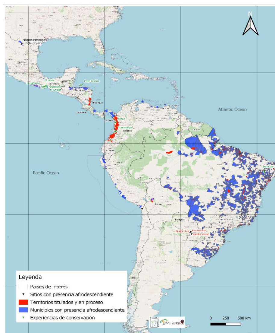
Map 6. Conservation experiences in Afro-descendant Peoples' territories