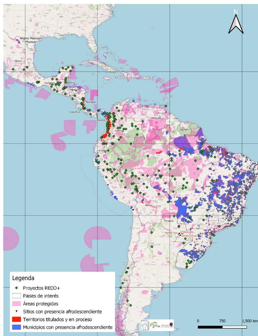
Map 5. REDD+ projects in Afro-descendant territories in Latin America

The participation of Afro-descendant Peoples in Paraguay and Chile have something in common, which is the absence of an ethnic differentiation process for the communities. The countries' national strategies highlight the role of local communities and Indigenous Peoples and—in the case of Paraguay—in the sustainable management of forests (Ministry of the Environment and Development of Paraguay 2019). The Chilean case highlights inclusion within the strategy of potential risks with the implementation of REDD+ initiatives and the socio-environmental impacts that these risks may trigger (National Ministry of Agriculture 2017).