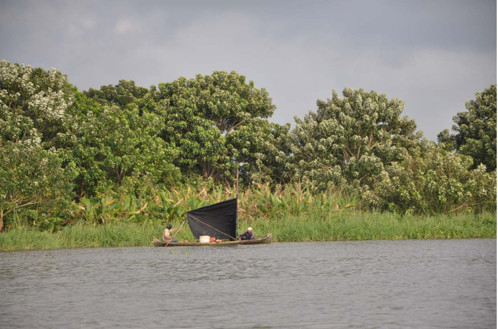
Fishermen of the Caribbean region of Colombia.