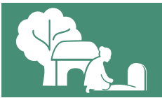
INHERITANCE AT THE NATIONAL LEVEL

The Latin American countries studied provide the strongest protections for all women's overarching inheritance rights.