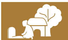
INHERITANCE AT THE COMMUNITY LEVEL

African countries afford indigenous and rural women the weakest community-level inheritance rights .