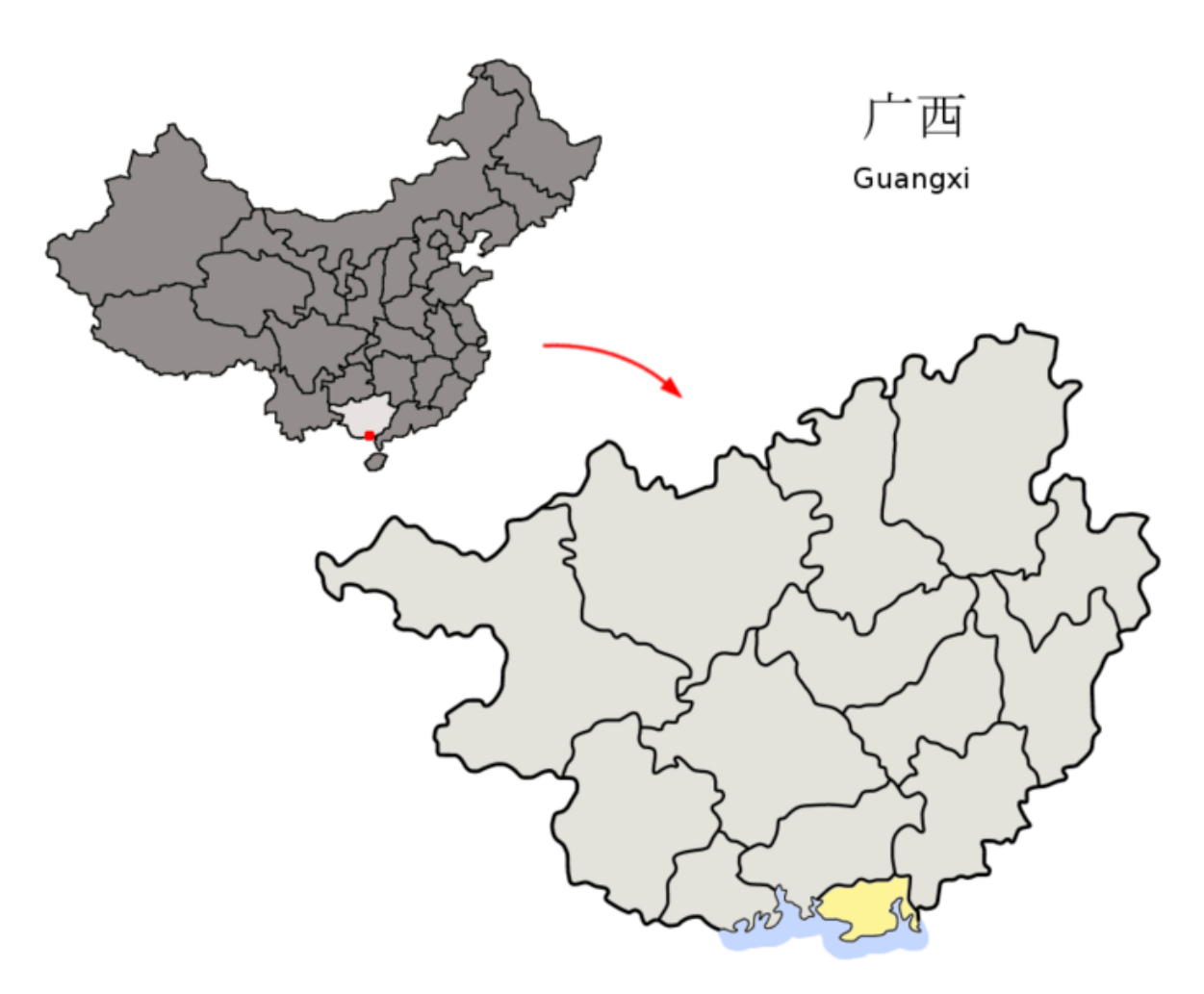
FIGURE 1. GUANGXI PROVINCE, BEIHAI MUNICIPALITY

Note: Hepu County is located in Beihai Municipality (yellow) in Guangxi Province